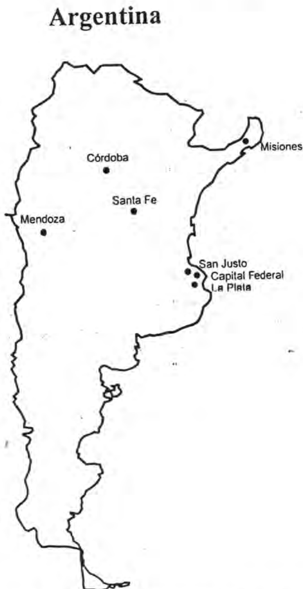
FIG. 3. Collection sites participating in the multicenter study of Streptococcus pneumoniae .

Serotype 23F SPN was poorly represented (2.2%) among the strains collected in the Argentinean surveillance. 17 Two of them, isolated in Capital Federal, were multiply antibiotic re-